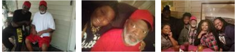
Nini - April 17, 2020 at 10:50 PM

“ Thank u 4 bein a gudd father & role model u were very lovin n carin ya was a very strong individual i could go on but i will keep it short but i will truly miss u & jus kno' ur babygurl luv ya n gonna try 2 stay focus n remain strong 🍷💕💕💕